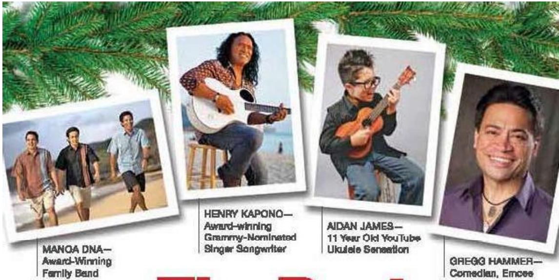
MANOA DNA— Award-Winning Family Band