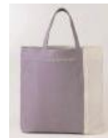
USA Exclusive Tote Bag (Notfor sale)

First 20 customers, who make a purchase over $450, will receive a "USA Exclusive Tote Bag" (picture shown) ONLY at the Waikiki store on Thanksgiving day. Limit one per person.